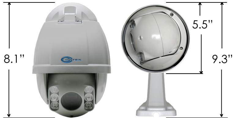
Big Power In A Small Package