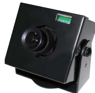
Optional Board Lens