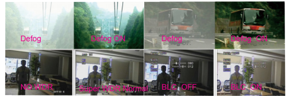
ODS Control Settings