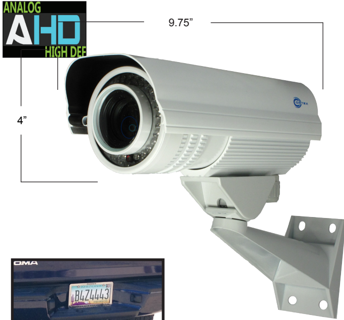
Shown with COR-210W Bracket Sold Separately